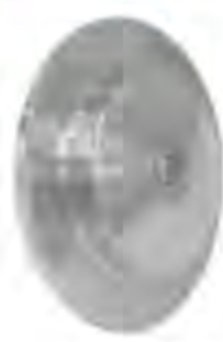
Nozzle without gasket type