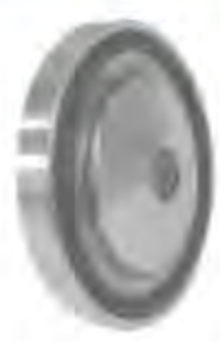
nozzle with gasket type