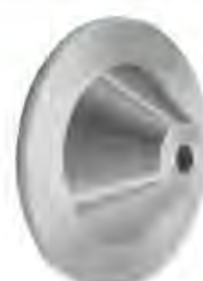
nozzle with gasket type