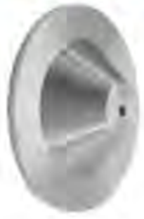
nozzle without gasket type